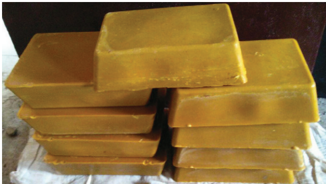
Bees wax on sale