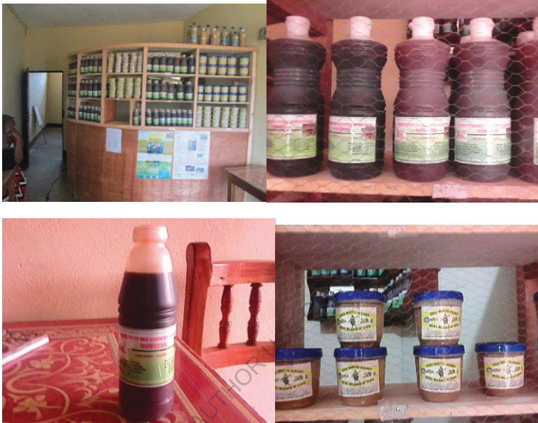
Brown honey, Oku White Honey and Bumble beehoney of various quantities sold at different prices